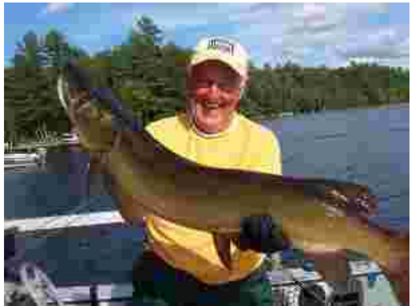
Coach with a nice 46.5" Musky caught Aug. 3rd. I think this is his pet musky that lives under his dock.