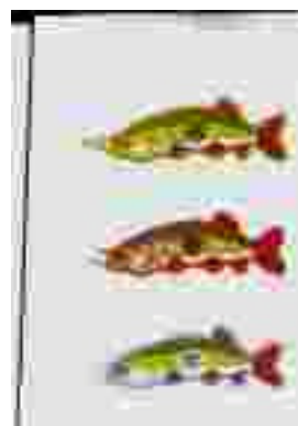
Gold 30 year fish dangler